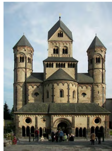
Abtei Maria Laach