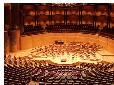
Philharmonie – Cologne