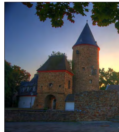
Hexenturm – Rheinbach