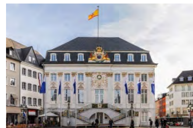
Old Town Hall – Bonn

We hope you had a wonderful visit, and we look forward to the next RRX Exchange! Safe travels!